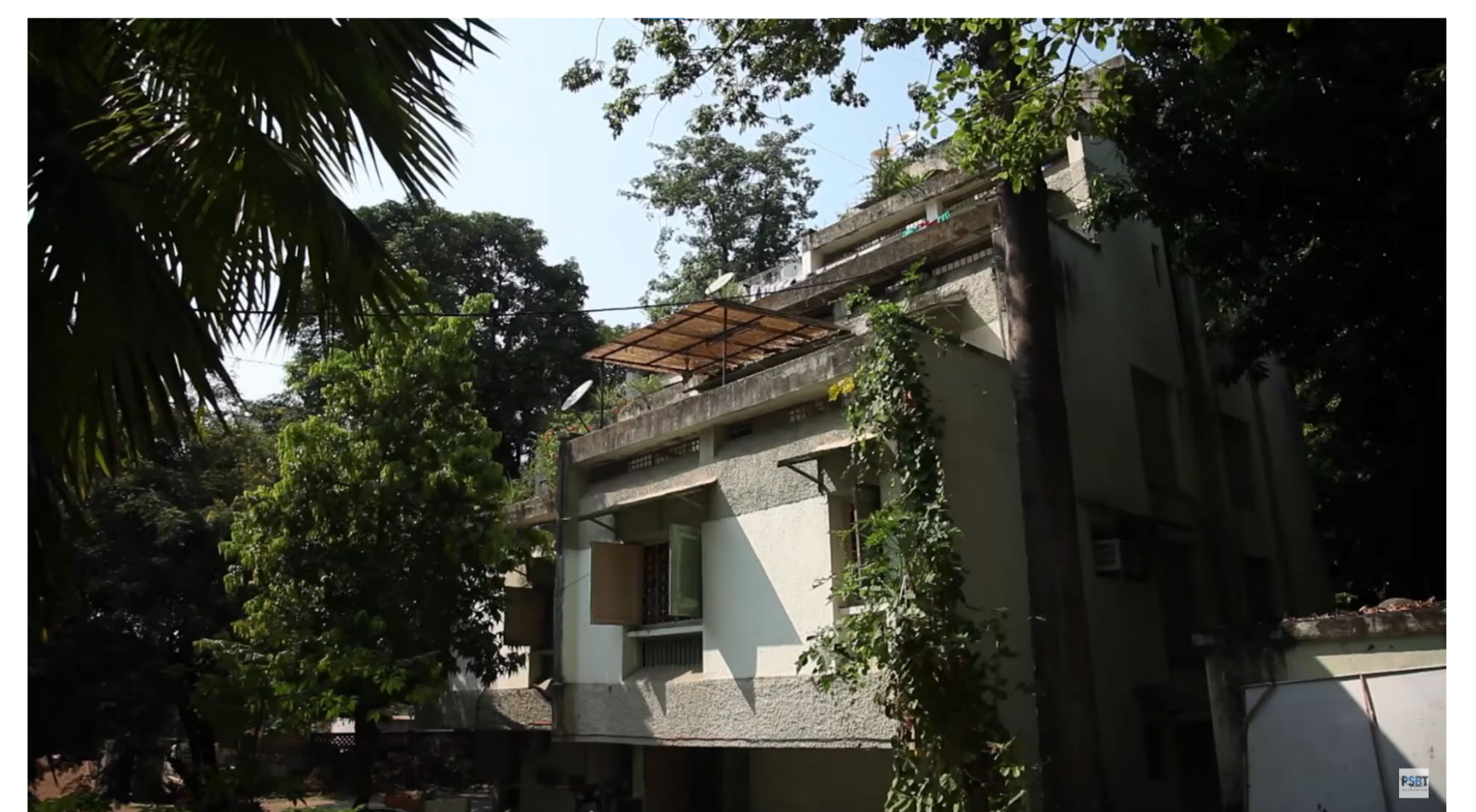
The outside view of LIC Colony, still from the film Lovely Villa – Architecture as Autobiography (9:15)

The film is a tribute to the post-independence Indian national identity and the national vision for affordable housing for the middle class. Being a housing complex built by the Life Insurance Corporation of India (LIC) and designed by architect Charles Correa, it is a promise of future as those who fulfilled the payment requirement of the insurance policy will own the property at the end, while the buildings are specifically designed to bring different social classes and immigrating white-collar works together, resulting in an interesting intermingling of population within a greenery-surrounded area in the middle of the metropole, creating a collective memory belonging to the specific historic epoch.