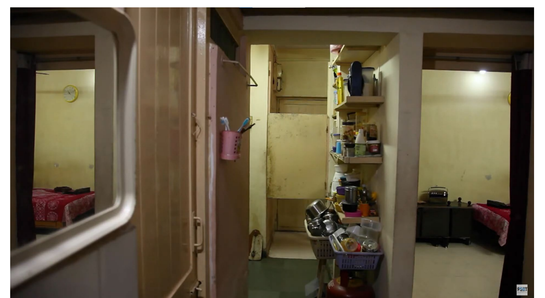
Inside view of the house, still from the film Lovely Villa – Architecture as Autobiography (10:27)

Charles Correa's design philosophy is reflected in the housing complex and influenced the way the filmmaker perceives an ideal living space. Every housing complex has large spaces on top for access to the sky and large openings on the side for cross ventilation. Different sizes of apartments allows a healthy mix of different social classes in the same building, and communal spaces are incorporated in the design so that neighbors could interact with each other. All the footpaths were interconnecting so that residents could reach their house without crossing the main street, and children of different families could play together. The physical spaces the architecture creates impact the life of residents on a daily basis.