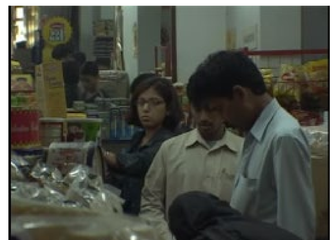
Still from "The House on Gulmohar Avenue", 00:10:50 min.

Family are portrayed and how they dealt with it. Other people from the Okhla district were interviewed to share not only the story of a family, but also one of the neighbourhood.