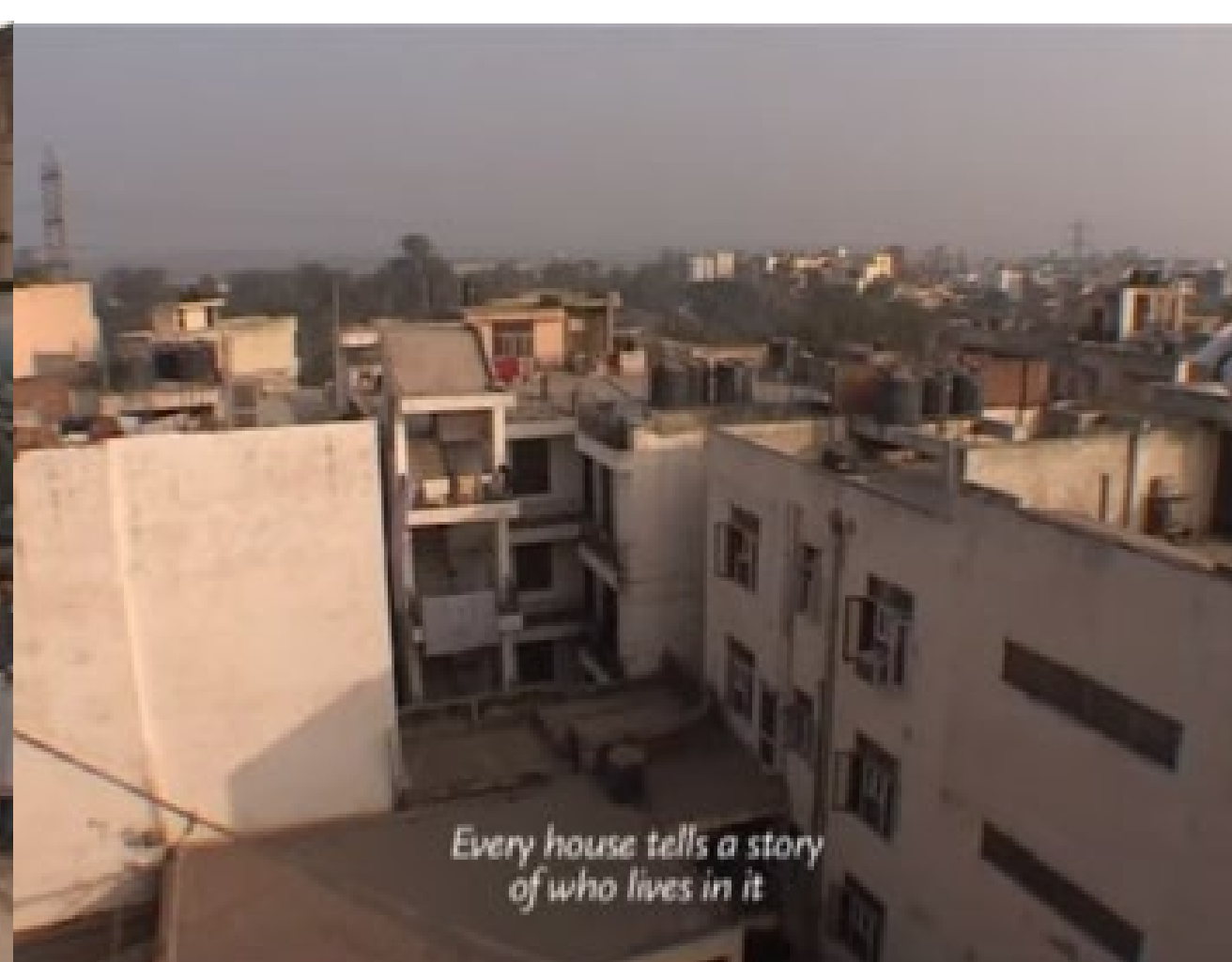
Still from "The House on Gulmohar Avenue", 00:14:13 min.