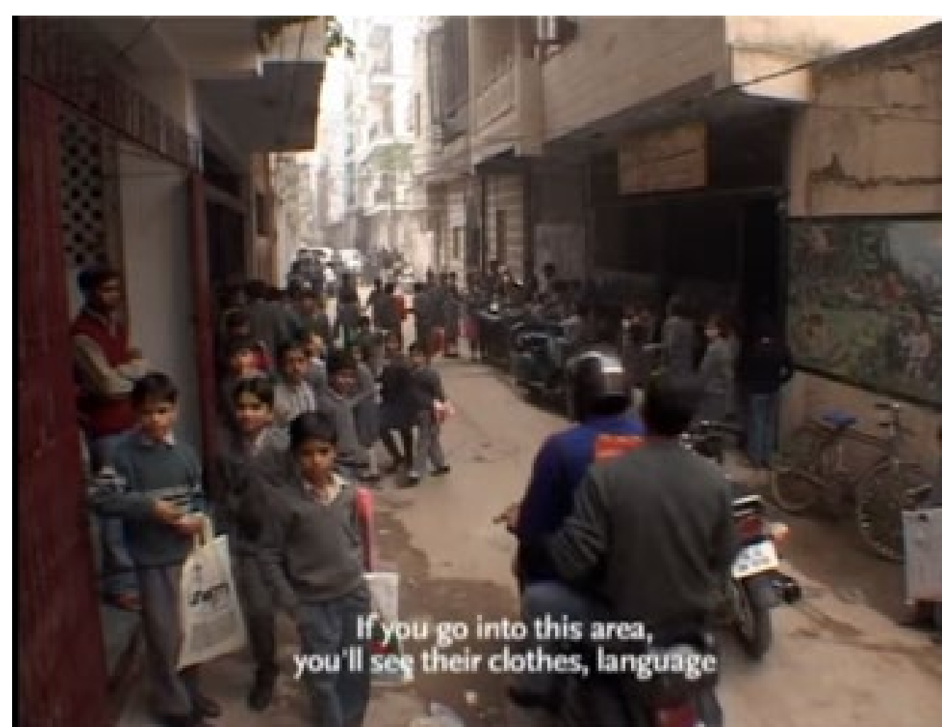
Still from "The House on Gulmohar Avenue", 00:14:02 min.