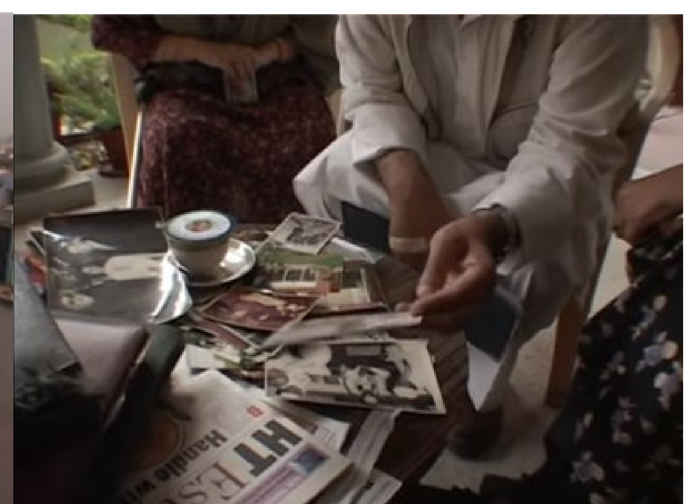
Still from "The House on Gulmohar Avenue", 00:17:24 min.