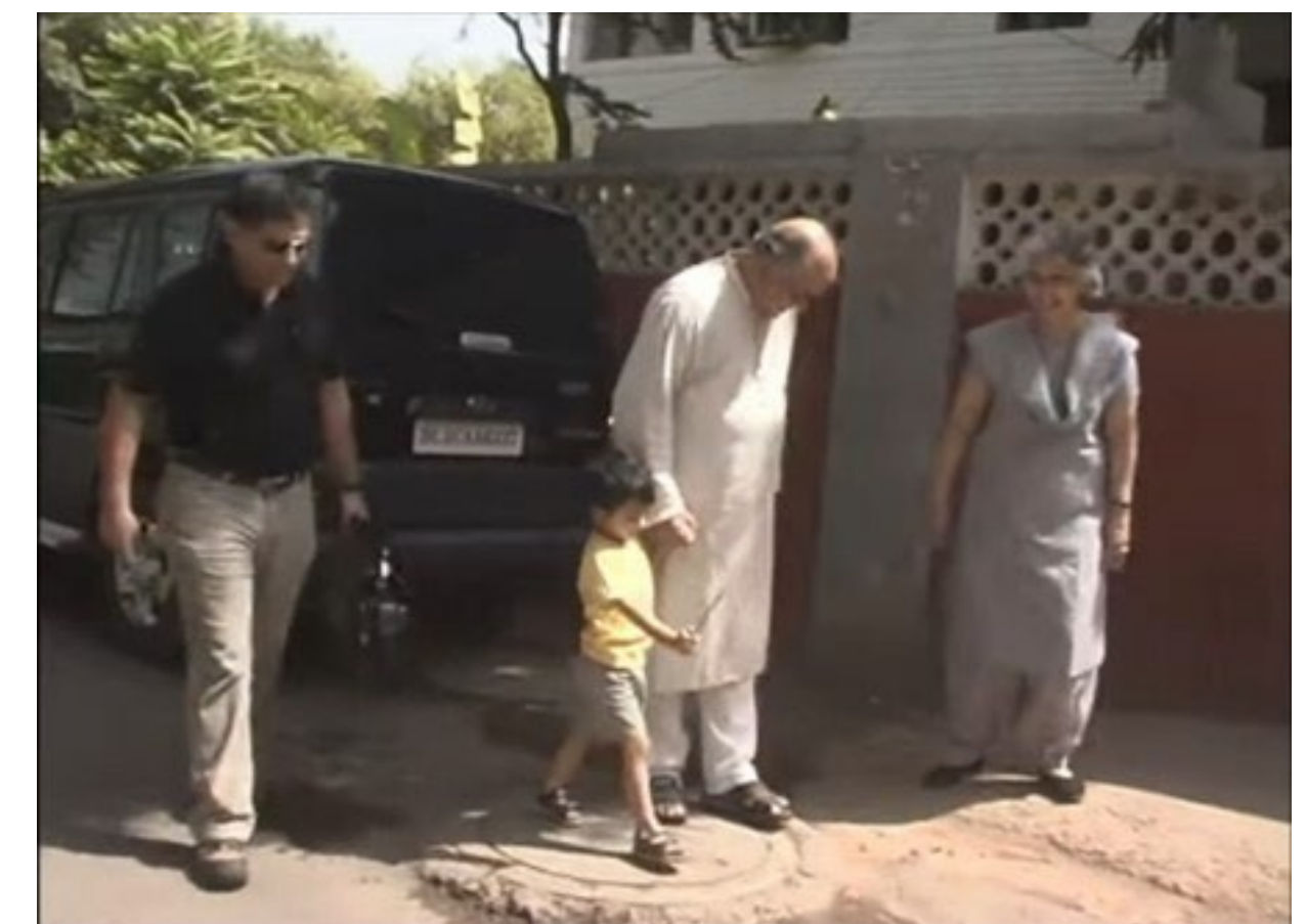
Still from "The House on Gulmohar Avenue" 00:22:28 min.