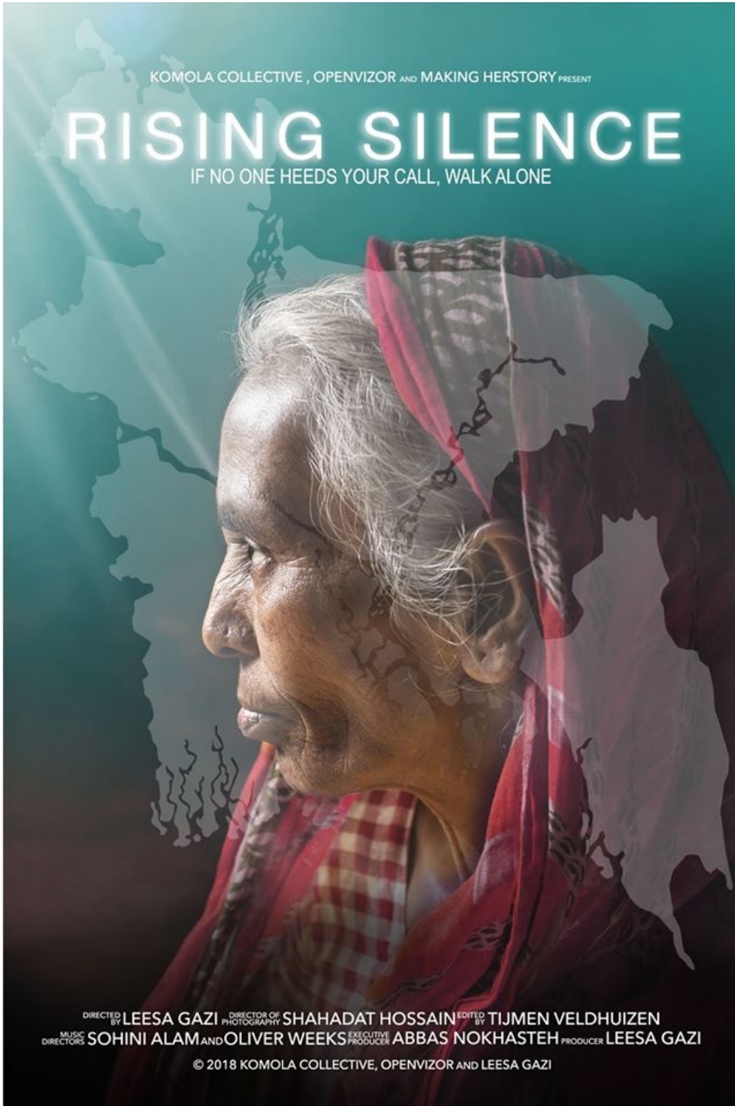
Figure 2, source: Leesa Gazi.