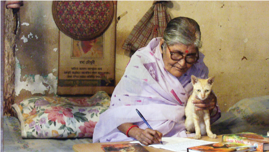
Figure 5, source: still from The poison thorn .