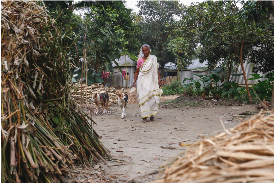
Figure 4, source: photo credit by Shihab Khan.