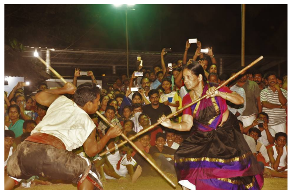
Photograph by Ashitha Mandakathingal, 20 May, 2017.

By exemplifying Kalaripayattu a South Asian martial art and its transregional practices and performances in the context of contemporary India, this paper will problematize the general notion of martial art as a masculine space and inherently exclusive to women and demonstrate how specific historical, cultural and social location affects the gender performances of this individual performance art form. By using performance ethnography, my study compares the practices and performances of women in Kalaris (institution provides the training of Kalaripayattu) situated in the villages of Kerala and the women performers in metropolitan cities in south India such as Chennai and Bengaluru.